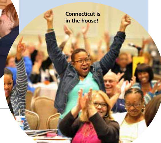
Connecticut is in the house!