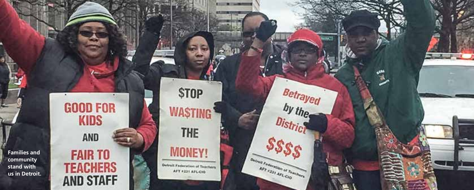
Families and community stand with us in Detroit.