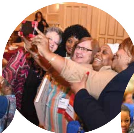
A salute and a selfie for the PSRPs.